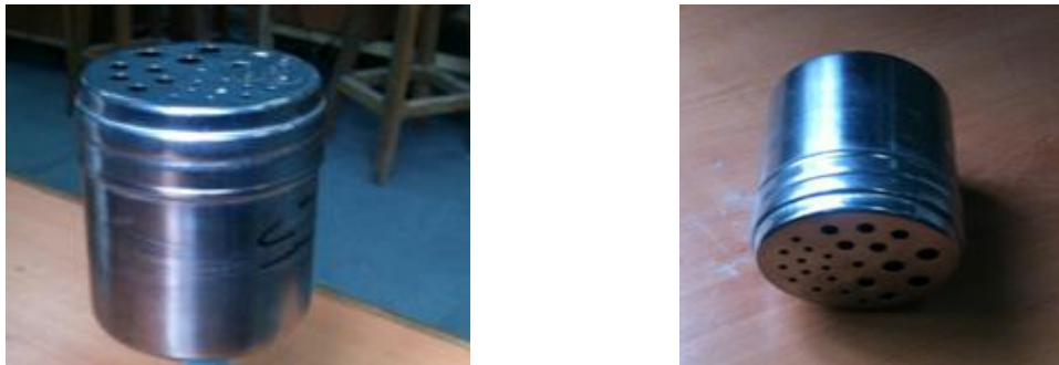
Fig. (1): The designed dosimeter.

In this work, Solid-State Nuclear Track Detector techniques has been employed by using CR-39 detectors which were fixed inside the steel chambers in a form of 1X1.5 cm plastic detector pieces, (Fig. 1). The designed dosimeters have been suspended on the walls of tunnels at different positions along the tunnel. After 60 days of exposure the suspended dosimeters were collected.