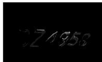
Fig.4 Character segmentation on Canny edge-detected image.