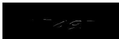
Fig.2 Character segmentation on Sobel edge-detected image.