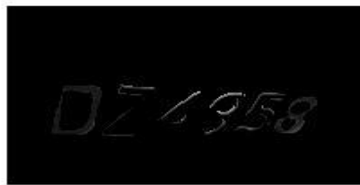
Fig.6 Pin segmentation on Wavelet pre-processed Canny edge-detected image.