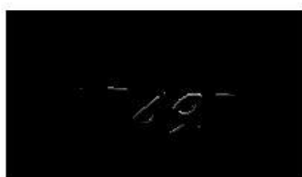
Fig.3 Pin segmentation on Prewitt edge-detected image