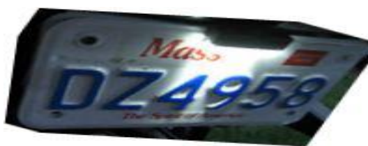
Fig.1 Original IC image.