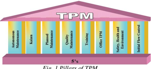
Fig. 1 Pillars of TPM