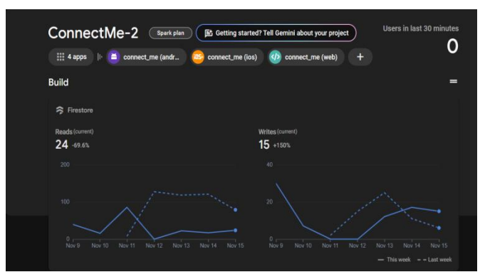
Figure1: Firebase Dashboard and Analytics

Fig. 1 illustrates the Firebase dashboard for the ConnectMe app, highlighting real-time Firestore usage metrics. The graph displays the number of reads and writes over time, providing insights into the app's dynamic interaction with Firebase services. These metrics demonstrate the efficient handling of user data and reliable backend functionality [8].