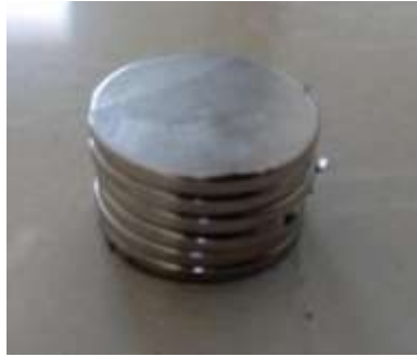
Figure 6: Permanent Magnet

(7) Battery: Lead acid cell is the most commonly used type of battery when high value of load current is necessary. In this engine 24V lead acid battery is used. The lead-acid cell is the type most commonly used. The electrolyte is a dilute solution of sulfuric acid ( H_2SO_4 ). In the application of battery power to start the engine in an auto mobile, for example, the load current to the starter motor is typically 200 to 400A One cell has a nominal output of 2.1V, but lead-acid cells are frequently used in a series combination of three for a 6V battery and six for a 12V battery