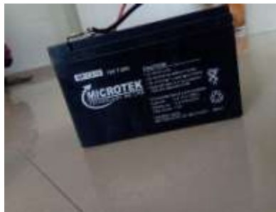
Figure 7: Battery (24V)

(7) Battery: Lead acid cell is the most commonly used type of battery when high value of load current is necessary. In this engine 24V lead acid battery is used. The lead-acid cell is the type most commonly used. The electrolyte is a dilute solution of sulfuric acid ( H_2SO_4 ). In the application of battery power to start the engine in an auto mobile, for example, the load current to the starter motor is typically 200 to 400A One cell has a nominal output of 2.1V, but lead-acid cells are frequently used in a series combination of three for a 6V battery and six for a 12V battery