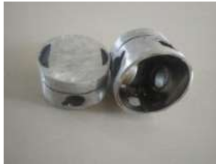
Figure 3: Piston