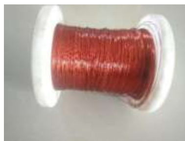
Figure 5: Electromagnetic Coil