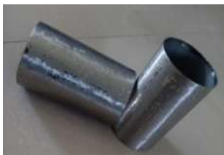
Figure 2: Cylinder

(1) Cylinder: The temperature within the electromagnetic engine cylinder is very low and so no fins are needed for heat transfer. These make the cylinder easily manufacturable. The cylinder is made of stainless steel, a non-magnetic material which limits the magnetic field within the boundaries of cylinder periphery.