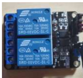
Figure 8: Relay

(8) Relay: A relay is an electrically operated switch. Current flowing through the coil of the relay creates a magnetic field which attracts a lever and changes the switch contacts.