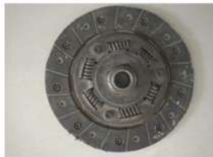
Figure 4: Fly Wheel