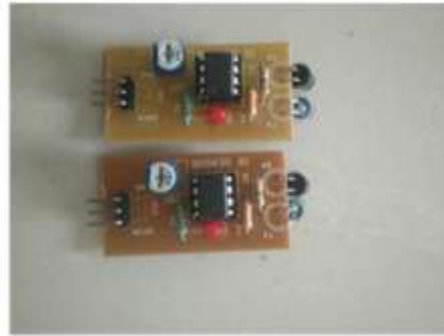
Figure 9: IR sensors