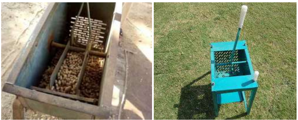
Fig 4: Actual model of hand operated groundnut decorticator [7]