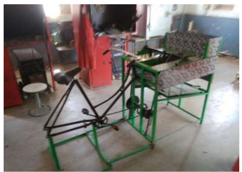
Fig 3: Actual model of pedal operated groundnut decorticator machine