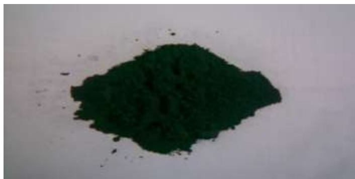
Fig. 1 Bagasse ash after grinding

The graph of the particle size distribution of the bagasse ash and ordinary Portland cement is as shown in fig.2.