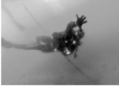
Figure 4 luminance map

LUMINANCE WEIGHT MAP : This map come through the luminance gain in the output image. This map explain the standard deviation between every R, G, B colour channels and each pixel luminance L of the input. Here the two input images are regenerate from RGB HSV space, for the component of V is the component of luminance .the luminance weight map plays a key role of balancing the brightness.