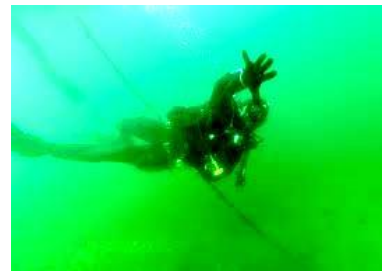
Figure 6contrast enhanced image

Image fusion: In the last step we have implemented a multi scale image fusion.Image fusion is a process in which the inputs are weighted by exact computed maps to preserve the most important perceived features. The main aim is just to combine the input weights various maps. In this approach we are combining the input data in a per pixel manner to minimize the loss of the image structure. Now we got two images as inputs, we have to extract the three weight maps for each individual image, they are :