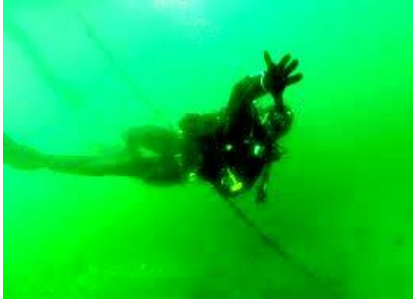
Figure 7final result

Result: Here from the above discussion we are taking different under water images from different sources and process them by applying the corresponding weight maps we can get the final image as shown in the figure 7. At first we are white balancing the image so that we can avoid the unwanted colour casts during various illuminants. After that we are now applying the weights to our white balanced image. In our approach we can get a picture of an underwater image with good colour clear details of the background. When compared with other techniques the mail structural alteration to our method is the amplified contrast. Our approach emphasize details without disturbing the colour. This technique requires very less computational means and is wellappropriate for real time applications. Finally in our approach it shows a good strength to protect the consistency in the appearance of colour for various cameras.