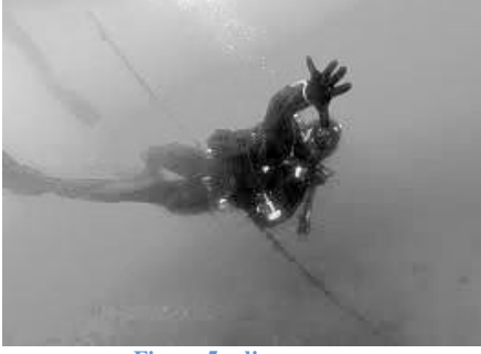
Figure 5 saliency map

Saliency weight map: The main aim of the saliency weight map is identifies the property with respect to the neighbourhood regions. The main information of the image is concentrated in only a small number of critical areas. This map reflects the distinction between a particular region and its neighbouring areas. If the area's distinction become more understandable, it will be easier to attract people's attention, and it will have greater impact. Different with the method in enhancing the global contrast which was mentioned previously, saliency map can make the edge of the original image to be highlighted. After extracting the contours of the local area. We increase the equivalent weight value, so as to accomplish the result of image distinction enhanced. Here, we use a newer method to generate Saliency map. They propose a regional contrast based Saliency extraction algorithm, which simultaneously calculates global contrast differences and spatial Coherence. The proposed algorithm is simple, efficient, and yields full resolution saliency maps this algorithm is consistently beat current saliency detection method, yielding higher precision and better recall rates. This algorithm can produce the full-resolution map. It is better than the previous method. The example for the weight map is show in Figure below,