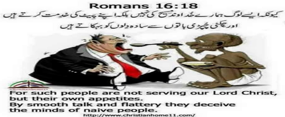
Plate 1 posted end time false prophet, Pope, Revfather king bush, Apostle, pastor, being feed by the poor through tithing and impromptu offering.

Rev father king bushes , pastors and doing the usual church routine( Sunday to Sunday and weakly Church activities ) while the Muslims brethren were gathering momentum to building and expanding mosques and trying to modified their cultural heritage that would have suite their own curiosity. Sir, did you normally tell them about the good message ( truth) of the coming of Jesus Christ so soon (100years or thereafter ) , did you usually tell them the danger of influx illegal immigration to another man country without national interest or international interest. Did you usually tell them the danger of overpopulation on a land that is fixed when factor of production increases ?The bible says the thief cometh to steal, kill and destroy while Jesus cometh to save and have life in abundant.